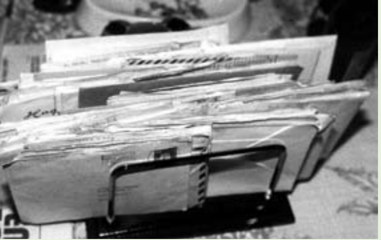
Each day, the brothers received letters from all over the world