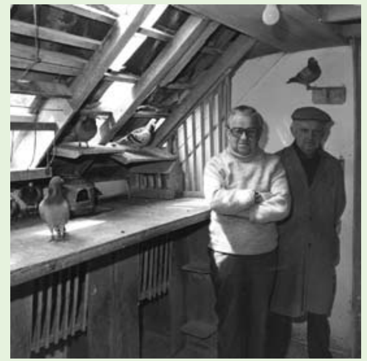
The interior the loft was only covered with tiles